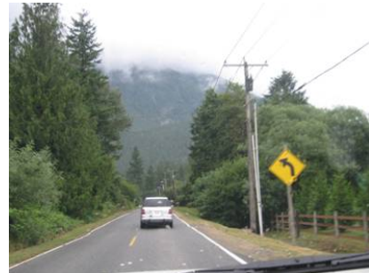
Heading to the river on a gray day

anticipated this, and had covered my pontoon with a tarp. I rolled out at about 7:30am for our meeting at 8:00. I pulled back the tarp and found one of my pontoons had lost about 50% of its air. I hoped it was a small leak so a top-up pumping would let me make the float. So I was off to the McDonalds in North Bend.