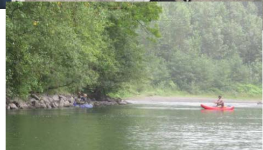
Rigging the boats to hit the Snoqualmie River at the confluence with the South Fork

legs and a size 14 lighting bug. Overall I think I got 12-14 fish all cutthroats, with 2 monsters of 12" being the largest.