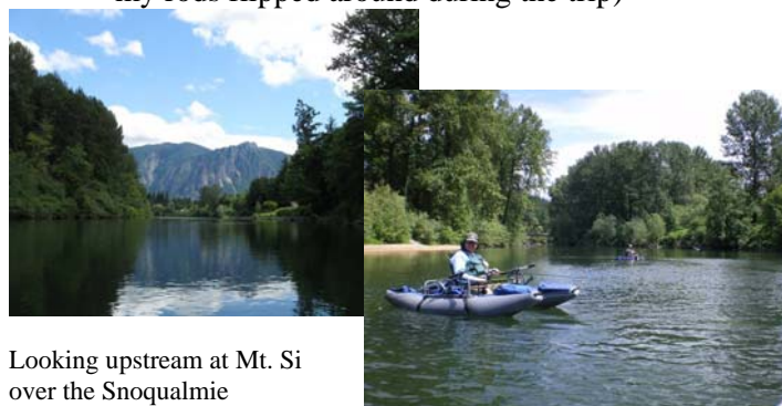
Looking upstream at Mt. Si over the Snoqualmie